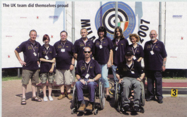
The UK team did themselves proud

great deal of history behind this sport in Italy and seeing is really believing. Further pictures of the event can be found on the UKBR22 website in the gallery section – www.benchrest22.org